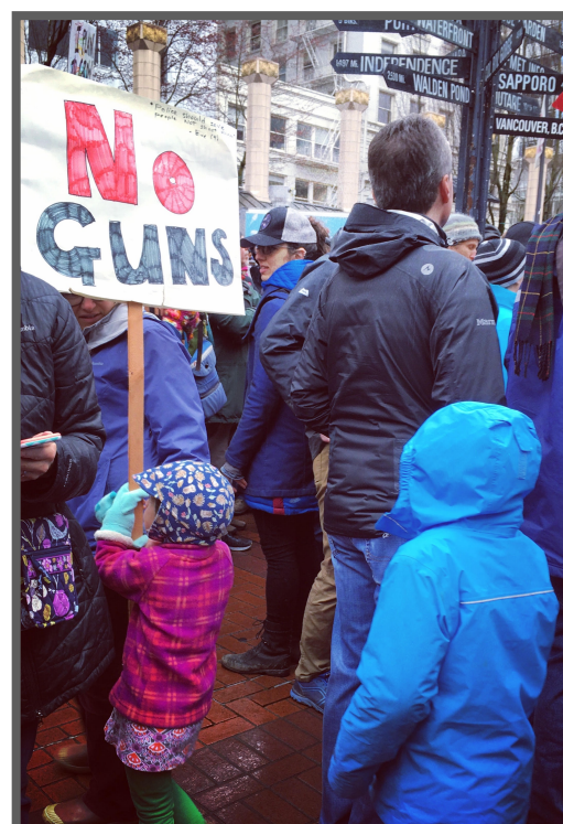
Scenes from Portland's March for Our Lives