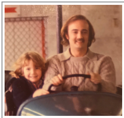
The author with her father

When my father died by suicide I was brought to my knees by overwhelming feelings of shock, disbelief, confusion, pain, guilt, anger, and love for him.